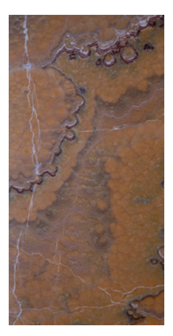
Onyx Honey 01