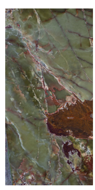
Onyx Jade 01

ONYX JADE is available in 3 slab options with maxium slab size of 1200mm x 2400mm