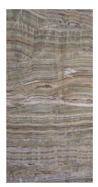
Onyx Bamboo 02