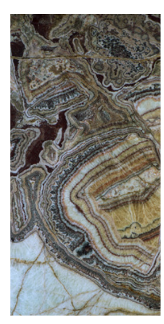
Onyx Crimson 01