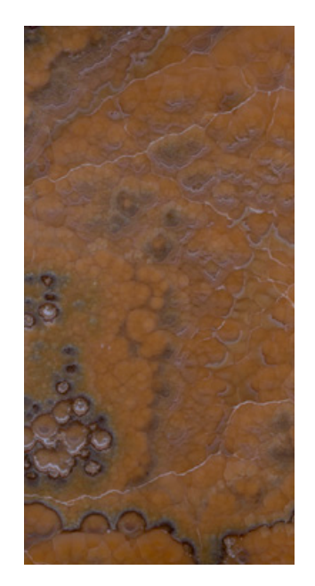
Onyx Honey 02