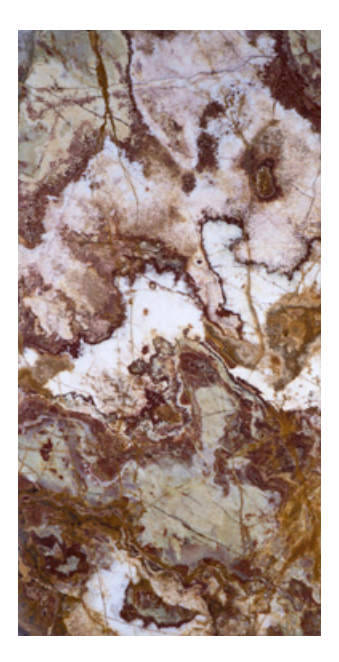
Onyx Maroon 01