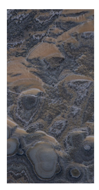
Onyx Smokey 02