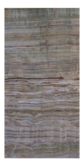
Onyx Bamboo 01

ONYX BAMBOO is available in 3 slab options with maxium slab size of 1200mm x 2400mm