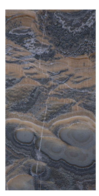
Onyx Smokey 01

ONYX SMOKEY is available in 3 slab options with maxium slab size of 1200mm x 2400mm