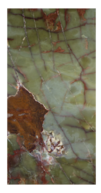
Onyx Jade 02