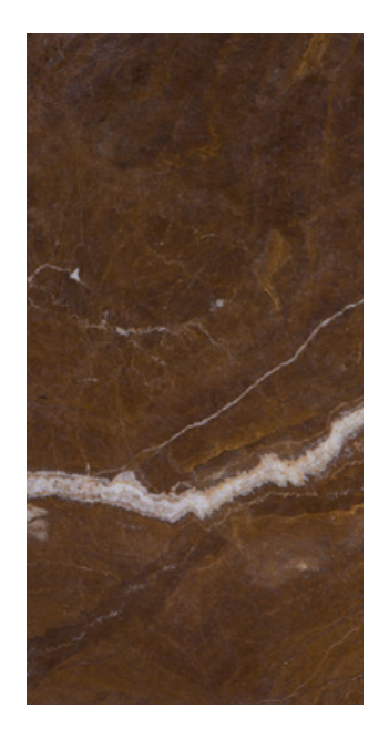
Onyx Bronze 02