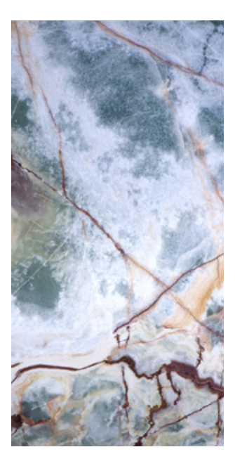
Onyx Emerald 03