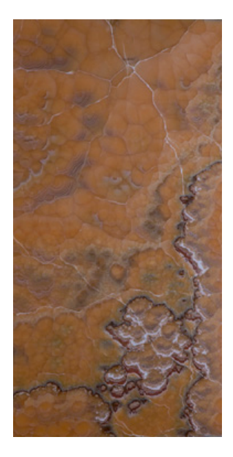
Onyx Honey 03

ONYX JADE is available in 3 slab options with maxium slab size of 1200mm x 2400mm