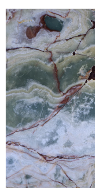
Onyx Emerald 01