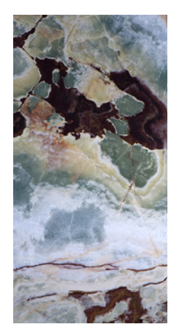
Onyx Emerald 02