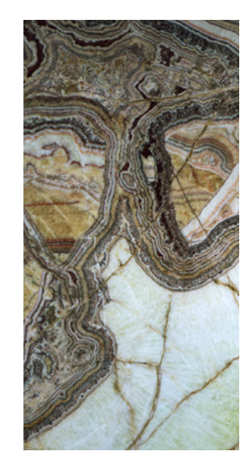
Onyx Crimson 02