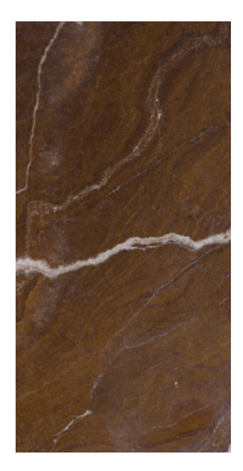
Onyx Bronze 03