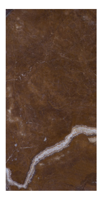
Onyx Bronze 01